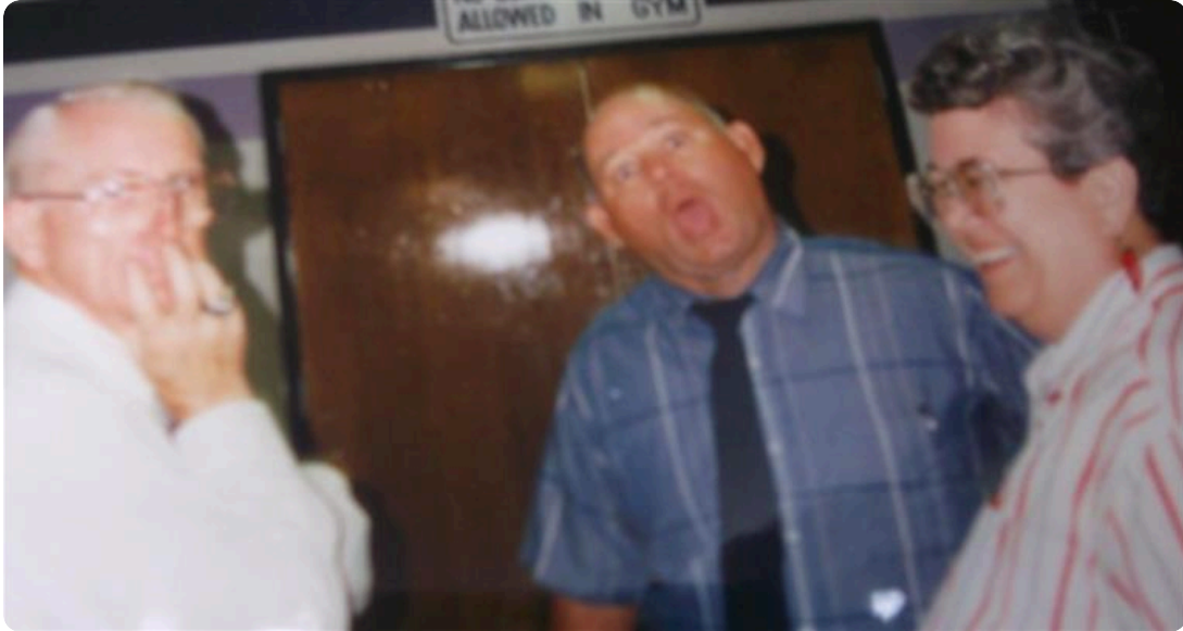
Three legendary coaches hanging together. WHS 1992